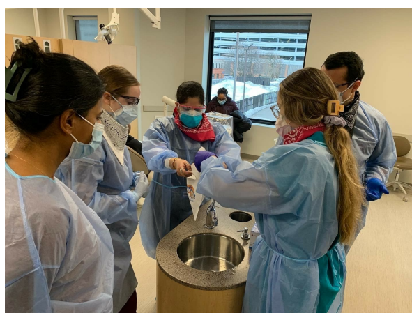
SDM dental students participate in the 19th Give Kids A Smile Day event!

..... Smile Education Day! Thousands of School Children Reached Across the Country Virtually